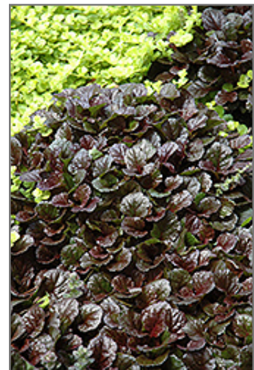
Black Scallop Bugleweed