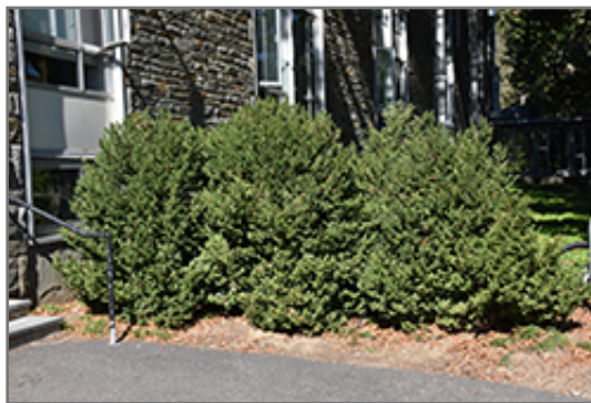
Green Mountain Boxwood